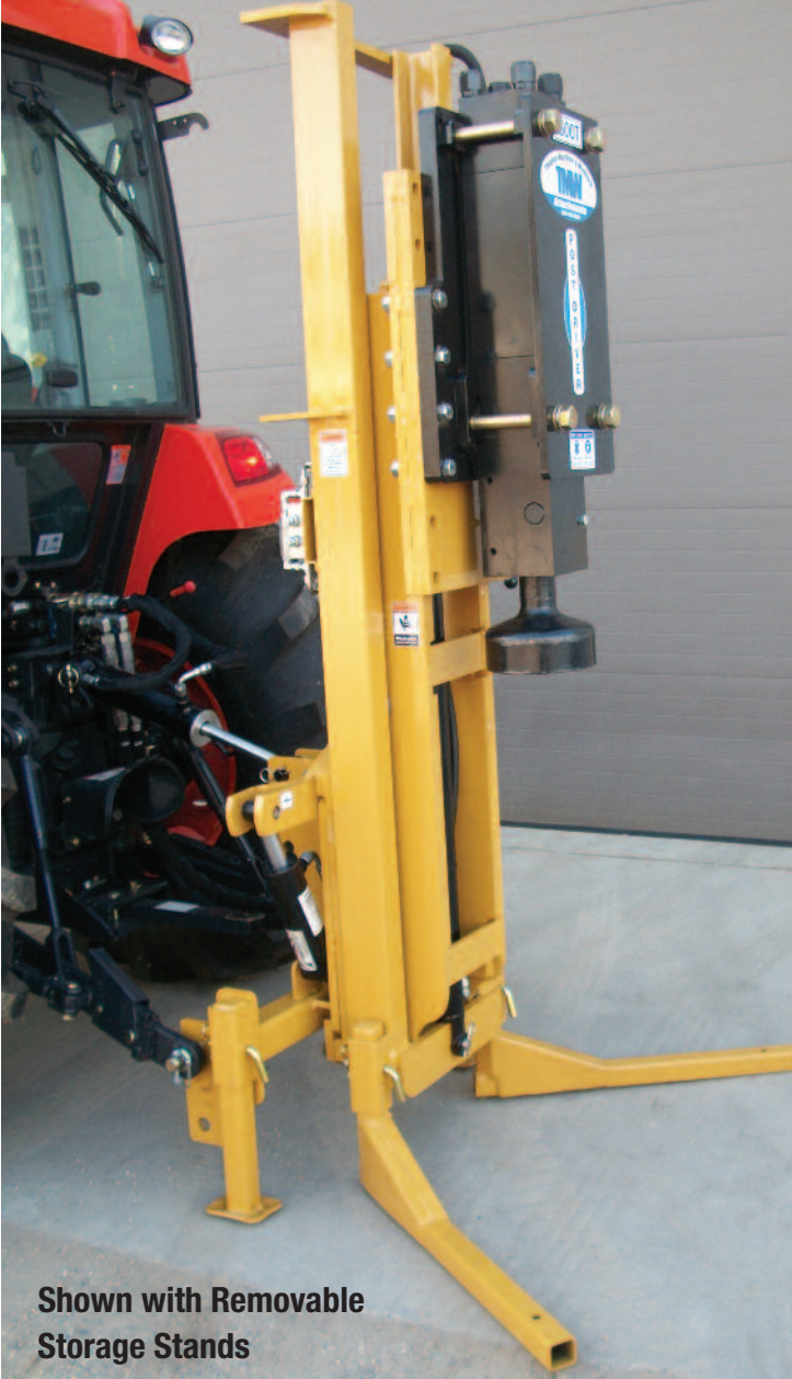
Shown with Removable Storage Stands