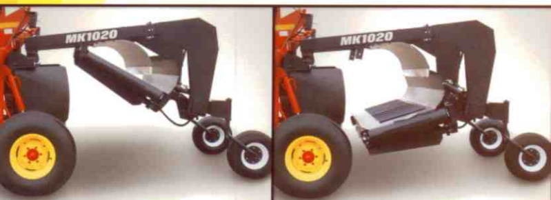
IN RAISED POSITION

In fact, using the Fusion saves time and money by cutting the number of windrows by half. This reduces the major expense of running a forage harvester, spending less time on each field and finishing the job faster.