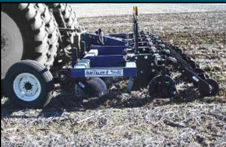
Optional StripTill mounting attaches to ShearBolt shanks